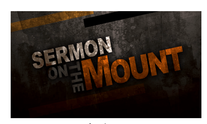
Beatitudes Part 1 Matthew 5:1-5